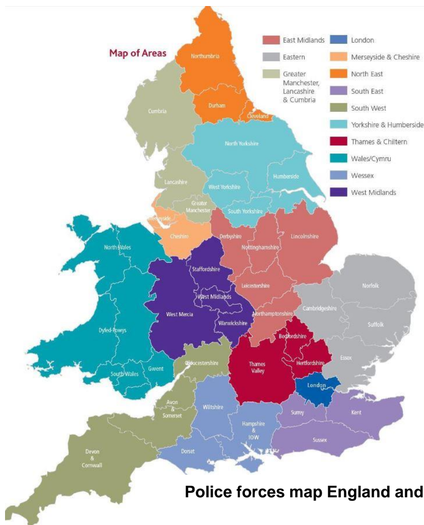
Police forces map England and Wales

The scope of this paper covers police forces within England, however National Statistics illustrate the police workforce as England and Wales combined and so the figures presented below cover all 43 forces across England and Wales.