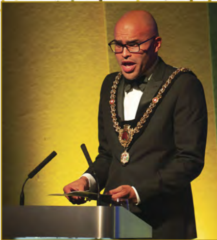
The Right Honourable The Lord Mayor of Cardiff, Councillor Daniel De'Ath