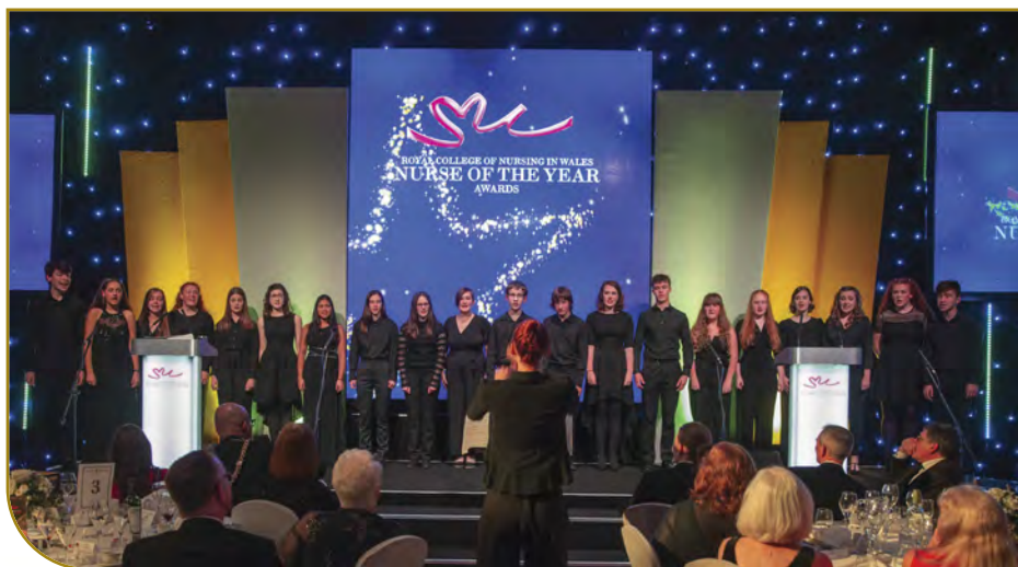
Cardiff County and Vale of Glamorgan Youth Choir