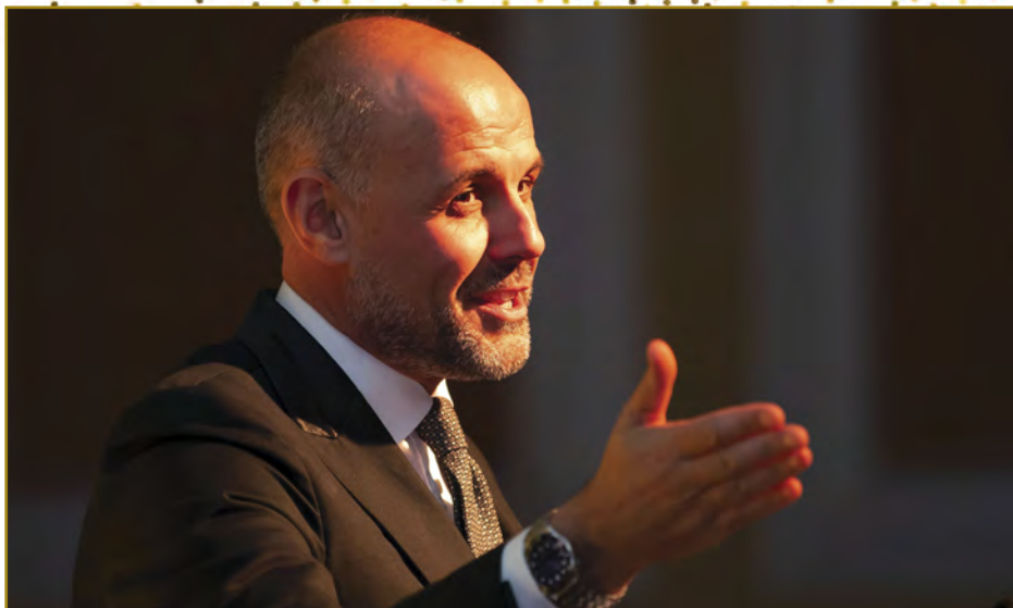
Jason Mohammad, Radio and Television Presenter