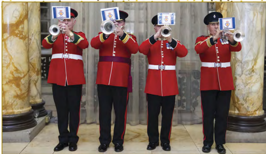
Royal British Legion Llanelli Band of Wales